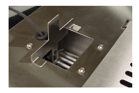
80820TL Sensor Adjustment Tool

Use the 80820TL Sensor Adjustment Tool as pictured, to assist in correctly adjusting the optical sensor. Sensor adjustment is critical for accurate data collection. If it is noticed that the LCD count is not increasing as the wheel is spinning, the optical sensor may need adjustment. To achieve maximum results, the sensor should be mounted at a distance of 0.2" from the rungs of the respective wheel. On a visual inspection, the lens of the sensor should be mounted slightly higher than the edge of the wheel. The sensor should be aimed directly towards the center of its wheel. It is recommended that the user clean the lens of the optical sensor with a clear soft cotton cloth before adjusting the sensor.